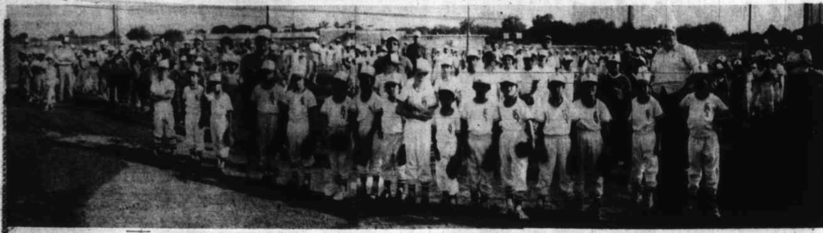
Two hundred and fifty boys and girls who will compete on the seventeen Eagle Lake Little League and Girls' Softball teams during the 1980 summer program were introduced at the formal opening of the program on Tuesday last week at the Youth Lighted Field. The players and coaches and managers lined up on the field making an impressive display of color in their brightly-colored uniforms and caps. Above is a panoramic view of the scene as seen from behind home plate at the Little League field.